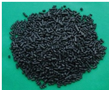
FIGURE 1. Carbon molecular sieve (CMS) pellets, typically manufactured from coconut shells, provide the surface area and pore structure needed to separate oxygen and nitrogen from a compressed air inlet stream

Nitrogen production that is carried out using pressure swing adsorption (PSA) technology over a carbon molecular sieve (CMS) is considered to be a mature, cost-effective and highly efficient method to produce nitrogen to meet a wide range of purity and flow requirements. Ongoing increases in efficiency in PSA-based nitrogen-generation facilities are being driven by enhanced CMS materials (Figure 1) and process improvements. This article provides an overview of the fundamentals of PSA-based nitrogen generation, while focusing specifically on innovative practices and improved CMS materials. Together, these advances contribute to continuous improvement in PSA system performance, giving chemical process industries (CPI) plant operators a proven way to produce a reliable and low-cost supply of high-purity dry nitrogen onsite.